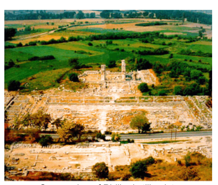
Some ruins of Philippi still exist.