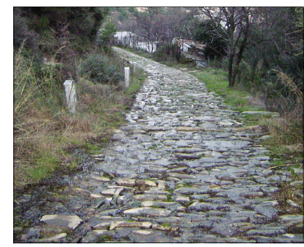
The Egnatian Way at Neapolis (Kavala).